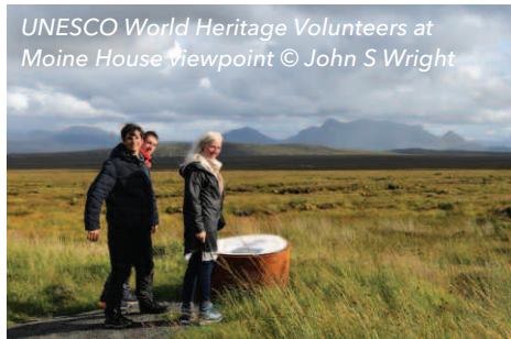
UNESCO World Heritage Volunteers at Moine House viewpoint

Meanwhile, the Peatlands Partnership partners will be continuing with peatland restoration where needed, subject to funding. They will also be looking at how further work can be funded to continue to spread the word and involve more people in the Flow Country both locally and beyond.