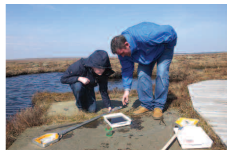
Pond dipping at the Flows Lookout, Forsinard