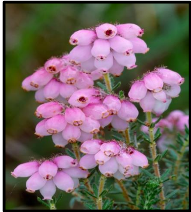
Cross Leaved Heath