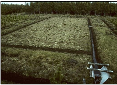
Block 1 with weir - 1989

Forest Research started a replicated experiment in 1989 to see how planted conifer forest impacted on a peatland site. Three forest types were established in small plots and a fourth plot was left unplanted as a control. The set-up was replicated in four places across the Bad a' Cheo Research Reserve. Levels across the plots were surveyed twice a year for the first five years then once a year for another five years. Over the ten years the ground surface subsided by up to 22 cm as a result of afforestation. Subsidence was much less in the drained but not afforested control plots.