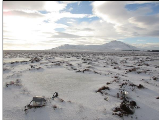
Left: A picture of the frozen natural pool system where flux and water samples are normally taken – but not this time, as the thick layer of ice was unbreakable. Right: Another one of the pools, also frozen, with a snowy Ben Griam Beg in the distance. The instrument that sticks out in the foreground is used to water depths and temperature in the pools.